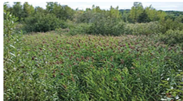
Marshland vegetation (Fig. 4)