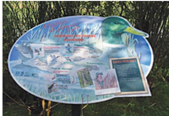
Information display (Fig. 2)