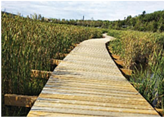
Wooden trail (Fig. 1)