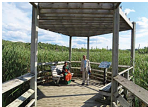
Tower (Fig. 3)